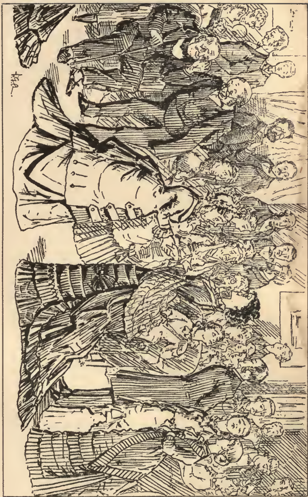
Mrs. Peterkin's Tea Party.